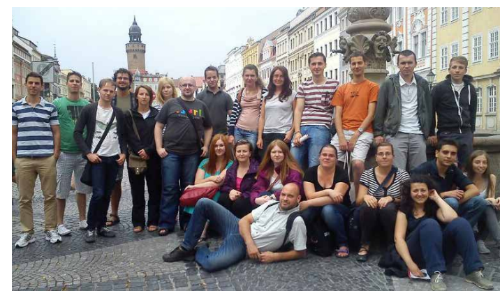
Fellowship recipients during a city tour