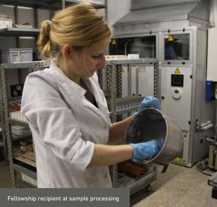
Fellowship recipient at sample processing