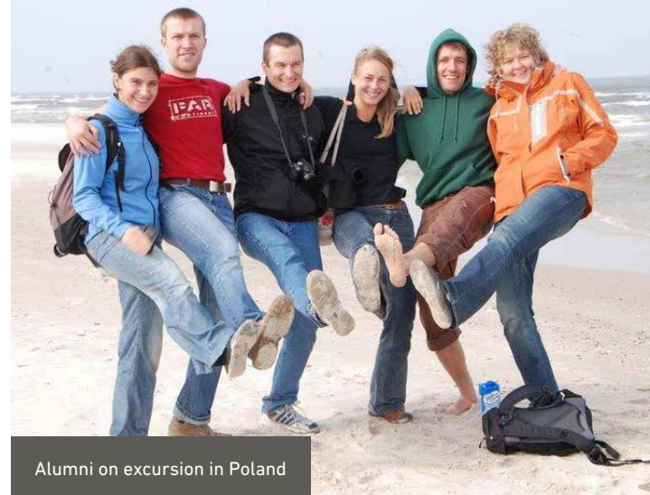
Alumni on excursion in Poland

During the fellowship practical solutions for current environmental issues are developed. After their stay in Germany the alumni are well qualified to tackle these issues in their home countries thus assuring efficient knowledge transfer. Working closely together in an international context helps to breakdown existing barriers. The acquired contacts will create a strong network of highly committed environmental experts.